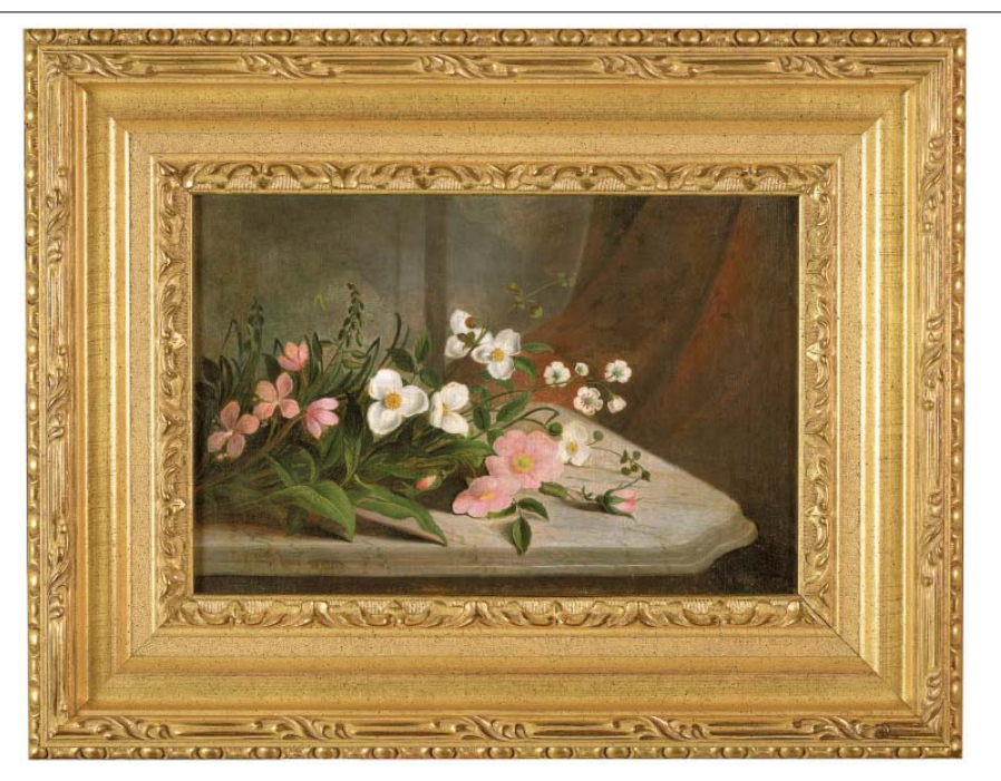
Wild Rose, Arrowhead, Great Willow Herb and Pipisisewa by Gibeon Elden Bradbuty 1865

New Gibeon Bradbury Floral Note Card Available 2012—