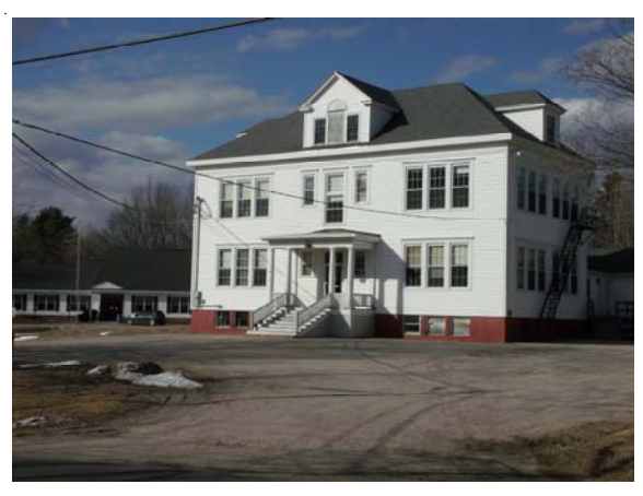
Old Bar Mills Elementary School —a Contributing Building in a DOT National Register Historic District