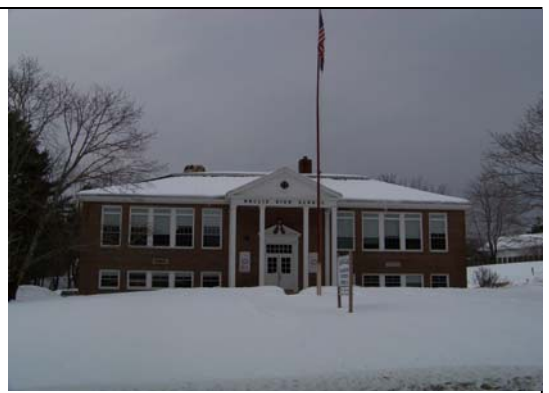
Hollis Learning Center

Work continues to find a solution for disposition of the Old Hollis High School building, a.k.a. Hollis Learning Center. At the July 12 meeting of the MSAD 6 Facilities Committee, there was discussion and consideration of the footprint of the land to be offered with the old Hollis High School in any proposal for the transfer of the building, either to the Town of Hollis (not likely) or in a sales offer on the open market.