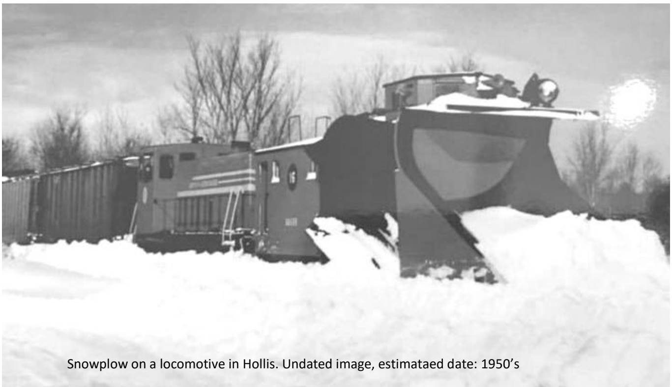
Snowplow on a locomotive in Hollis. Undated image, estimated date: 1950's