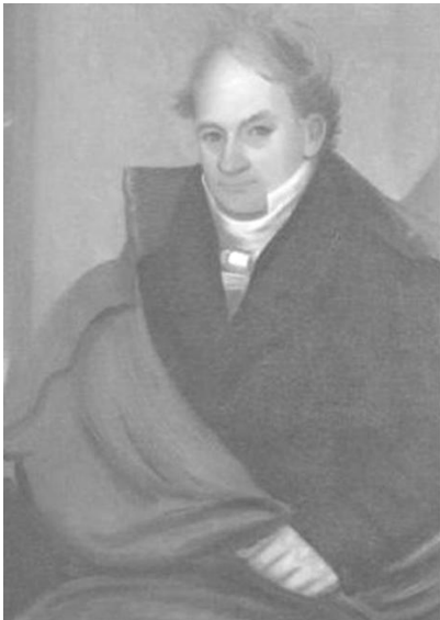
Colonel Isaac Lane portrait

There are many interesting historical figures to cover such as the Fighting Lanes, including Isaac Lane, a legislator, store and tavern keeper, fifer in the Revolutionary War and Colonel in the War of 1812. Isaac was a local organizer for the first area bridge in 1791 over the Saco at Salmon Falls and contributed rum to support the project. Can you imagine a village today taking on the cost or liability of building a bridge over the Saco? This was even before there was a good road to Saco, so one main purpose of the bridge was to get people across the river to church at Tory Hill on Sunday.