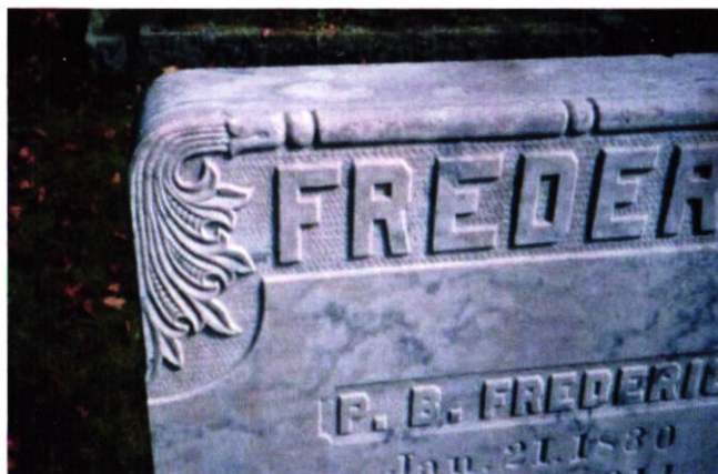
AFTER cleaning with ONLY water