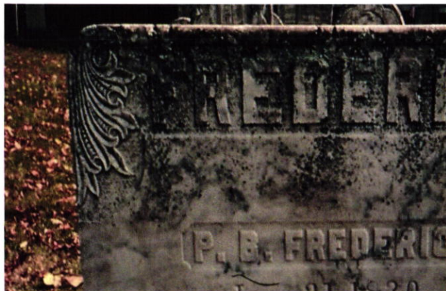
BEFORE cleaning with ONLY water

Cleaning gravestones is a wonderful way to preserve the past, but it is important to clean gravestones the correct way.